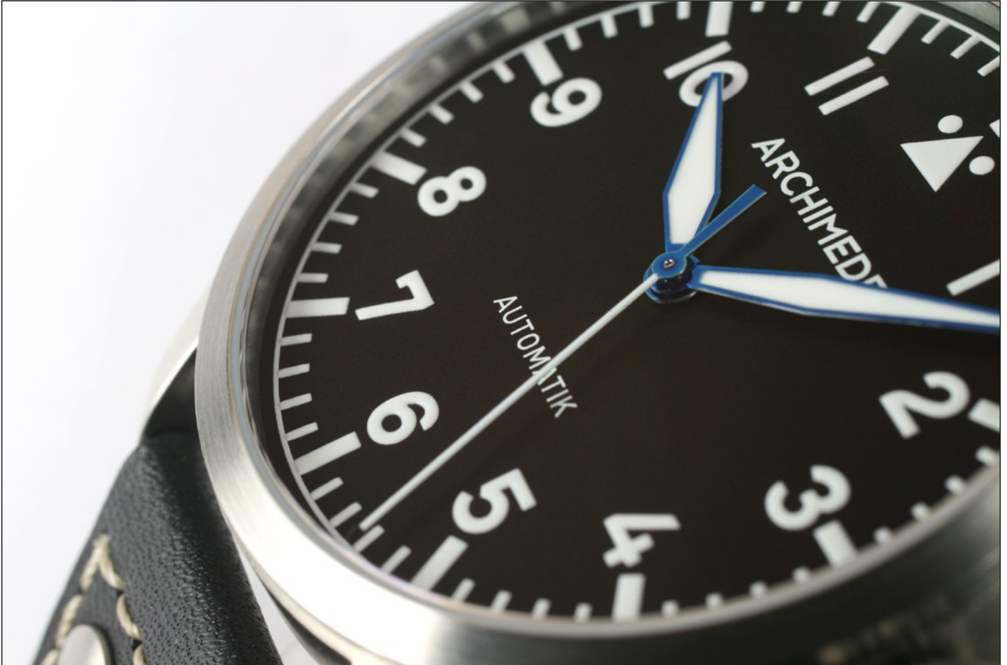
Photo der Pilot XL

The classic, timeless design of these pilot's watches evolved from the need for an instantly readable, highly accurate timepiece by early aviators. The large clear dial with luminous hands and numbers is protected by a sapphire crystal. The Swiss made ETA 2824-2 automatic movement is visible through the display back. The case is available in high grade stainless steel with a fine satin finish, or the Pilot T (42mm) in pure titanium.