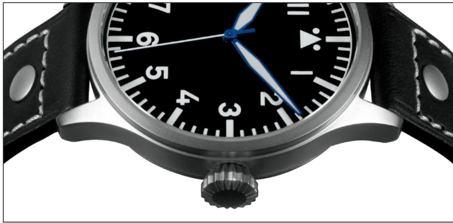
Pilot The classical Pilot's watch with 42mm case.