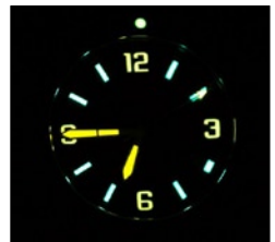
Lume of the SportTaucher Orange